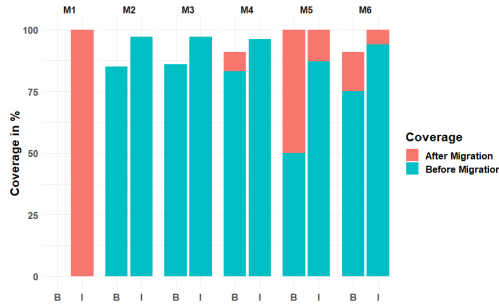
Fig. 7: Coverage improved by the successfully migrated tests (M=Method ID, I=Instruction Coverage, B=Branch Coverage) methods' code coverage. To determine this, we measure the methods' coverage using JaCoCo [38]. We first measure the methods' instruction and branch coverage without migrating tests. For the methods that have less than 100% instruction or branch coverage, we again measure their instruction and branch coverage after including successfully migrated tests.

2) Results : 6 of the 32 methods have less than 100% instruction or branch coverage. Figure 7 shows the instruction and branch coverage for the 6 methods before and after test migration. We find that 10 (13%) of the successfully migrated tests improve coverage of 4 methods. isEmpty method (M1 in Figure 7) in gson is not covered by any existing tests. In this case, a JTESTMIGRATOR's migrated test increases the instruction coverage by 100%. For the remaining 3 methods (M4, M5, and M6) in fastjson , JTESTMIGRATOR's migrated tests increase their instruction or branch coverage although they had high existing coverage (>82%). The libraries used in the evaluation are highly popular with many unit tests. Despite that, the migrated tests increase coverage of the 4 methods.